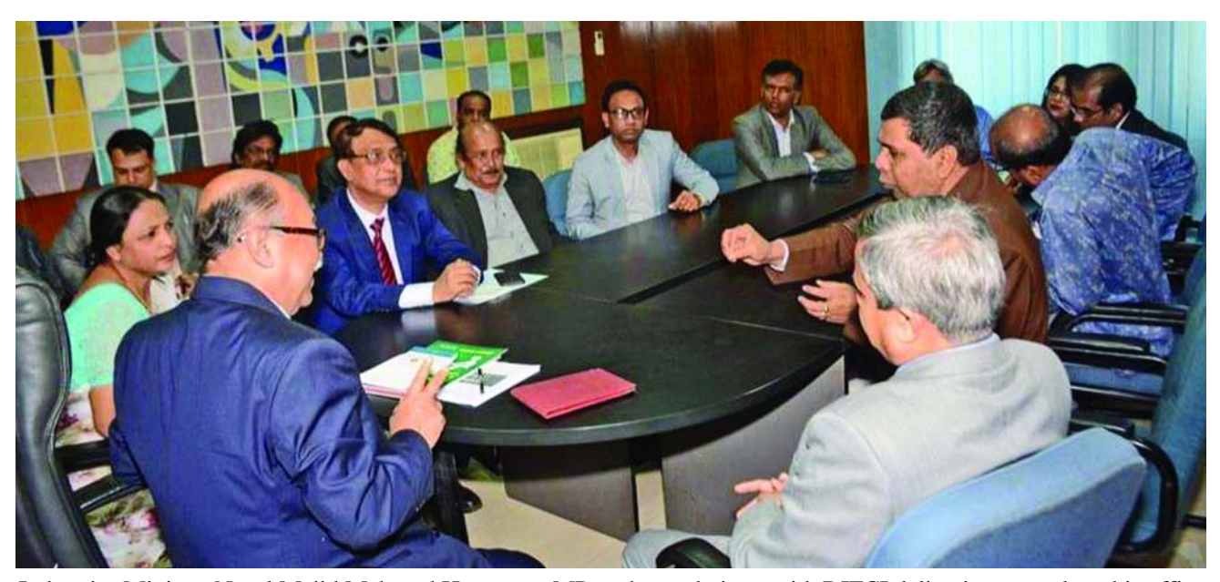
Industries Minister Nurul Majid Mahmud Humayun, MP exchanged views with BJFCI deligation recently at his office

The government has been implementing various projects for SME development and industrialization since long, the minister said and urged the BJFCI to work together with the government to implement the projects successfully.